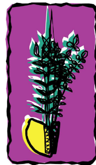
The Four Species

Have you ordered your Lulav and Etrog? (Lulav and Etrog sets: $40 each) Please contact the Temple office