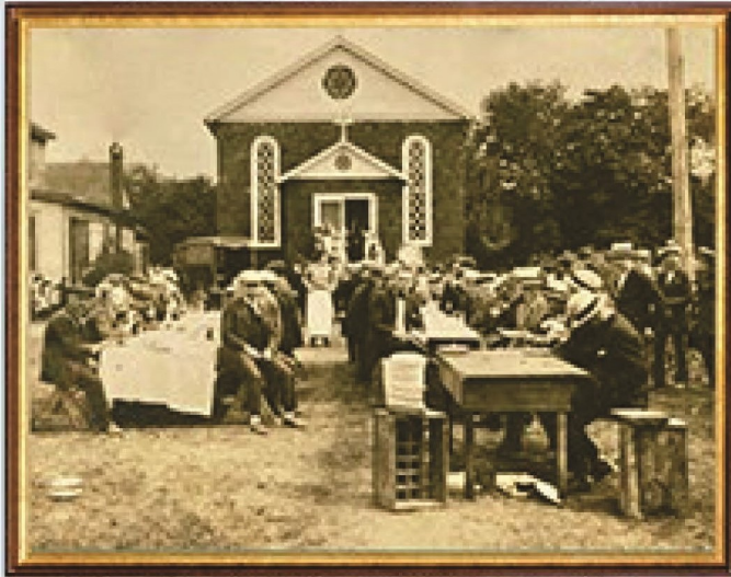
JEWISH BROTHERHOOD OF KINGS PARK SYNAGOGUE

Suffolk County Historical Society Museum Presents: