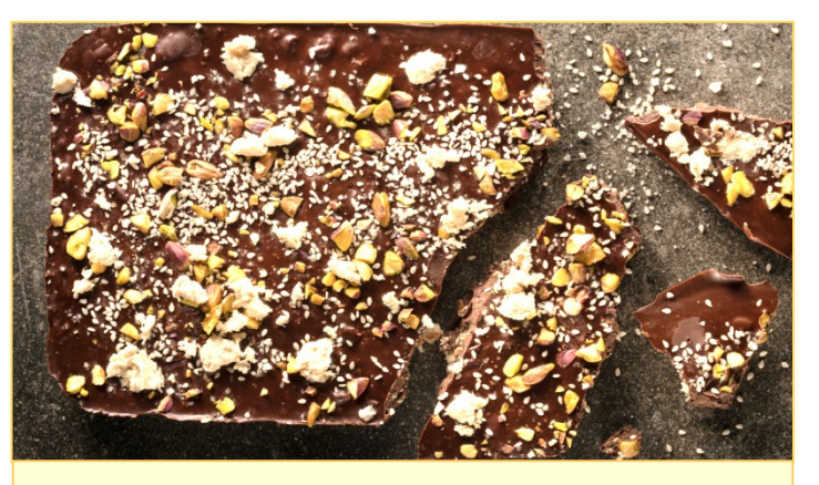
For a sweet finale to our High Holy Days, try this Halva Chocolate Bark treat!

Cook time: 3 min, Prep time: 5 min, Serves 8